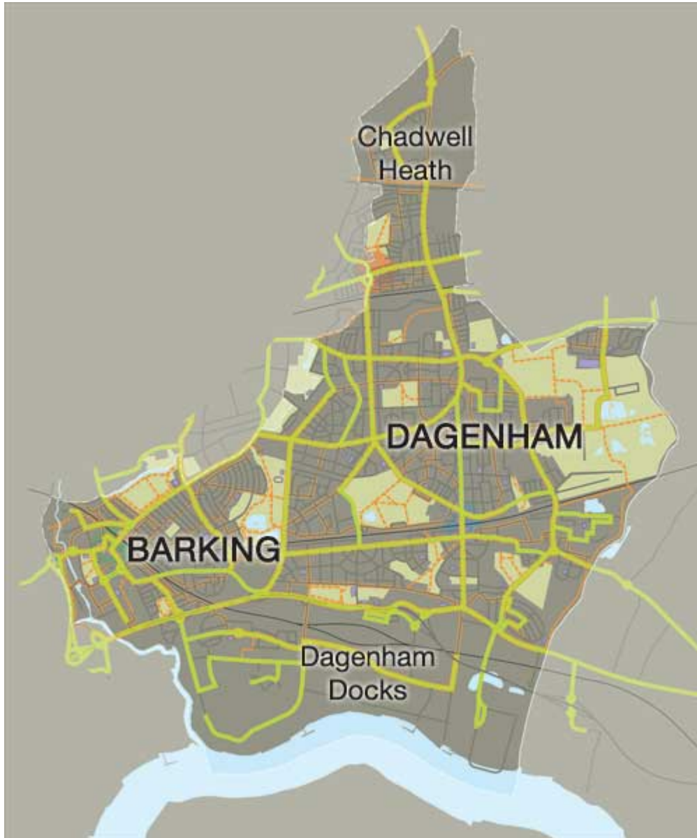
Figure 1 - Map of the borough